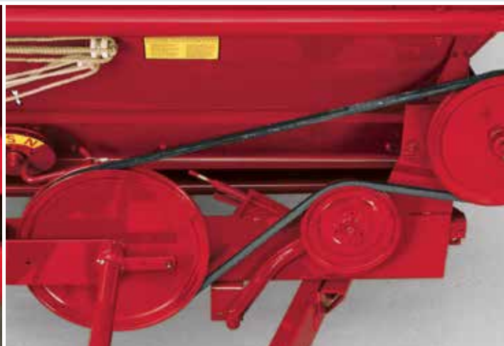
All models have a reliable straight-line V-belt drive that runs quietly and smoothly, eliminating the need for a slip clutch.